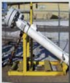
HIGH PRESSURE COALESCING FILTER UNIT