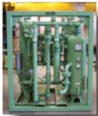
DESICCANT AIR DRYER