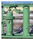
SCRUBBER / COALESCING FILTER UNIT